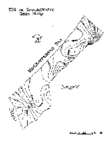
Figure 4. Total Dissolved Solids in Gaza's Groundwater (mg/liter).

settlers) are extracted annually from the Strip's increasingly depleted and increasingly saline aquifer (<u>Isaac et al 1994</u>). Water quality is appalling, as is suggested by Figure 4, which shows levels of total dissolved solids (TDS) in Gaza's groundwater: by way of comparison, note that TDS levels of over 1200 mg/liter are considered "unacceptable".